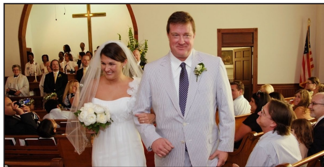
The Happy Couple