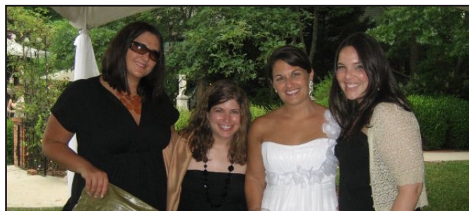
Lake of the Woods Ladies